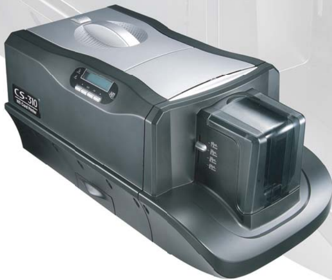
Photo Quality Simplex Card Printer with Amazing Value