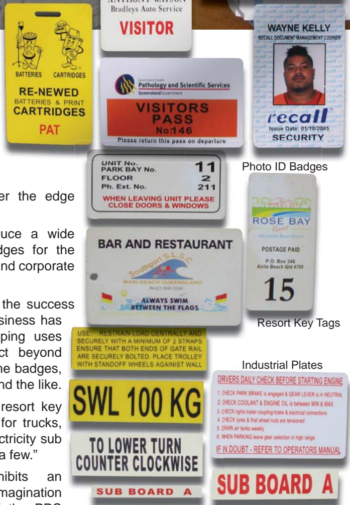
Photo ID Badges