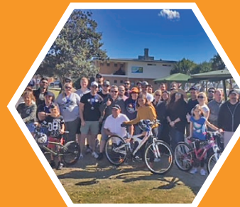
The PPC team taking part in the Bikes for Tykes program.

We fund PPC employees to donate $200 to a charity of their choice. – here's some of the causes we've supported: Youngcare, The Smith Family, Rural Aid, National Breast Cancer Foundation, Royal Brisbane and Women's Hospital, The Children's Hospital, GIVIT, Movember, The Salvation Army, UN Women Australia, Mater Foundation